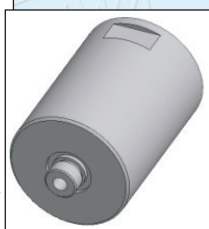
The stainless steel housing (#5.621)